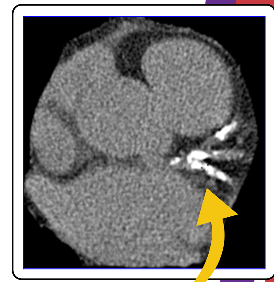
Calcium shown in a heart scan